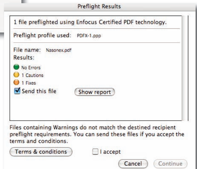
The Preflight Results

However, because you now have AdSIZE PRO SENDER, the ad file is automatically run